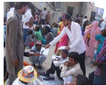
The man above is giving out our tracts in an open air market.

Another printing of our tracts was just done in Pakistan. Bro. Shahid Kaleem and our colabomers there are always excited when they have tools for doing evangelism outreaches.