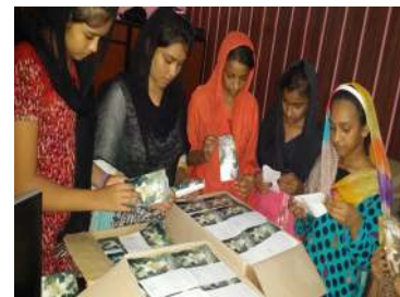
These women are hand folding tracts in preparation for their distribution.

You can help the gospel reach more people. You can direct gifts toward Pakistan, India, Thailand, or Myanmar.